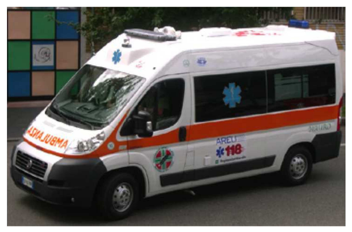
Figure A2: Ambulances and Medical Cars